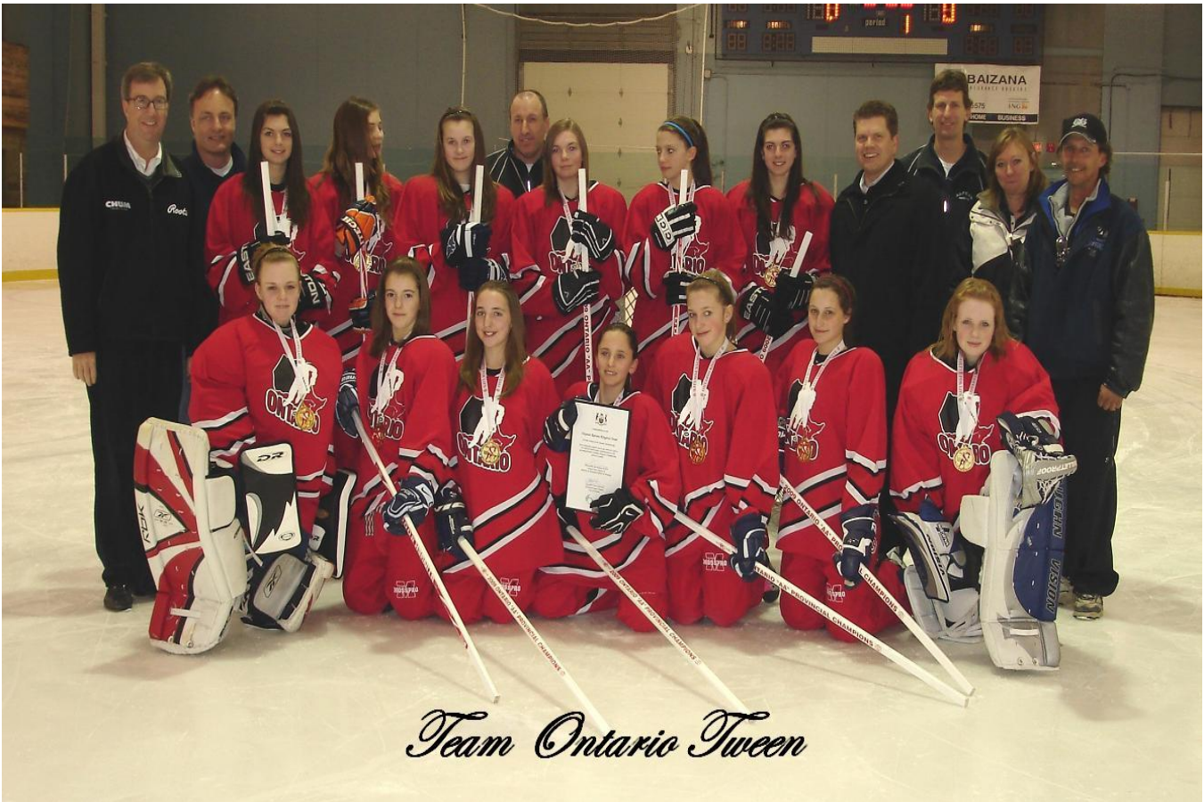
Team Ontario Tween